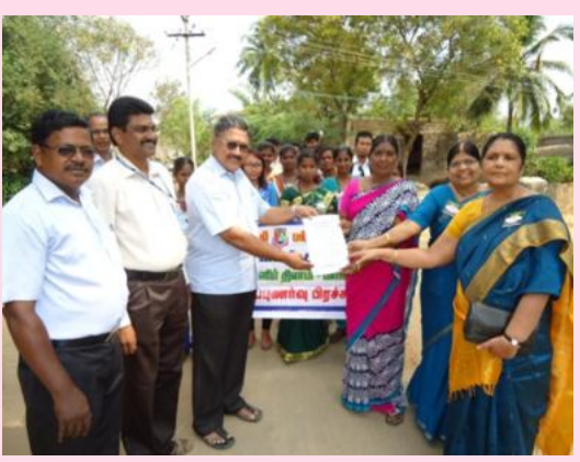
Social Awareness Rally

The department reaches the population of the surrounding villages (mostly backward and poor) enhancing their quality of life by organizing special awareness creation camps relating to health, education, hygiene, sanitation. employment. human rights and on eradication of social evils by involving students, research scholars and faculty members.