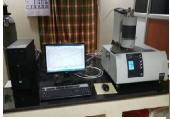
Simultaneous Thermal Analyser (STA)