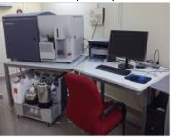
Flow Cytometer Cell Sorter (FACS)