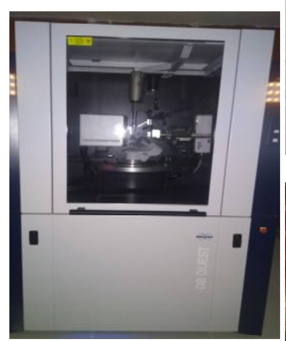
Single Crystal XRD (Brucker)