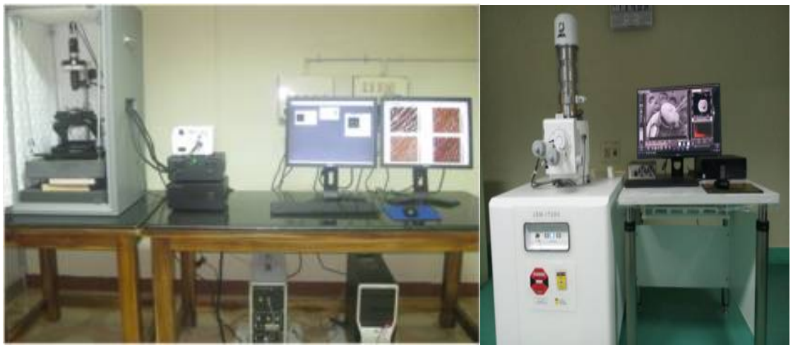
Atomic Force Microscope (AFM)