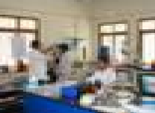
Instruments Lab - Marine Sciences