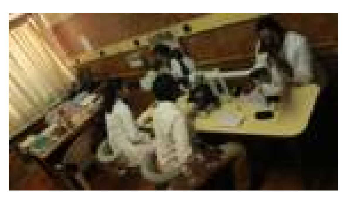
Oral Pathology P.G. Lab