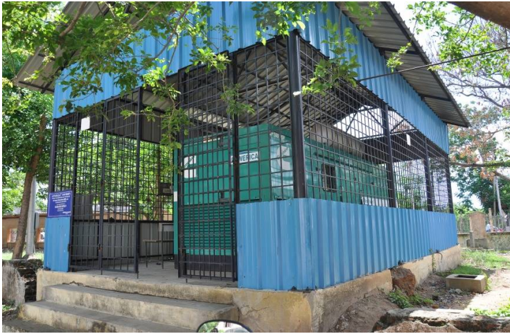
24 x 7 Uninterrupted Power Supply