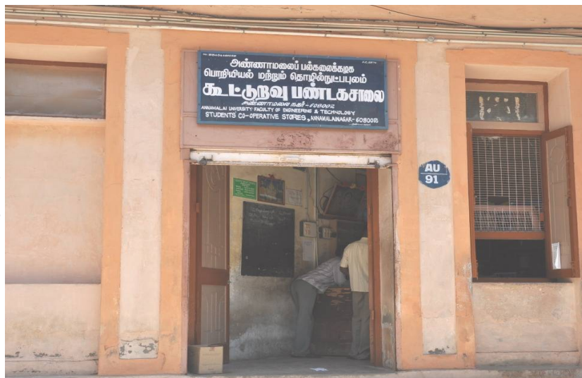
Students' Co-op Store