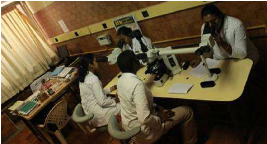
Oral Pathology P.G. Lab