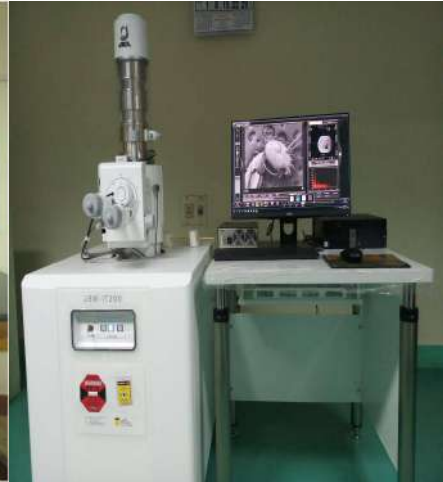
Scanning Electron Microscope - EDS (SEM-EDS)