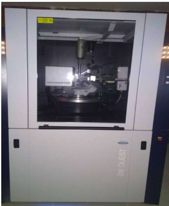
Single Crystal XRD (Bruker)