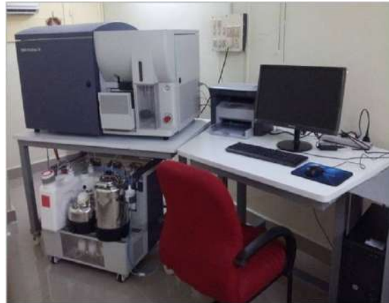
Flow Cytometer Cell Sorter (FACS)