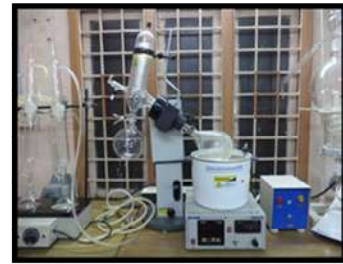
ROTARY VACUUMFLASH EVAPORATOR