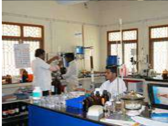
Instruments Lab - Marine Sciences