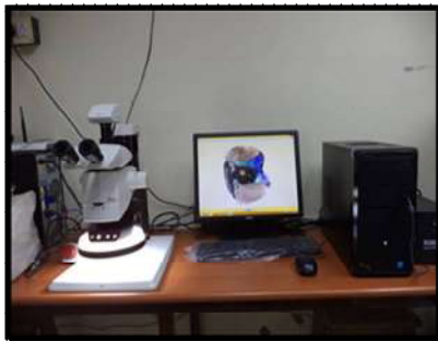
LEICA Stereo zoom microscope