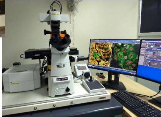
Laser Scanning Confocal Microscope (LSCM)