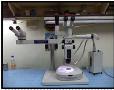
TRINOCULAR STEREOSCOPIC ZOOM MICROSCOPE