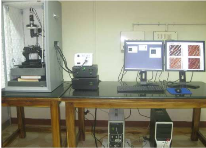
Atomic Force Microscope (AFM)