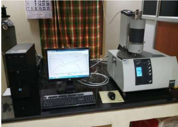
Simultaneous Thermal Analyser (STA)