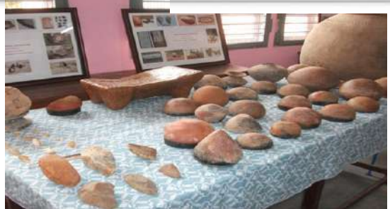
Archaeological Findings in the Museum