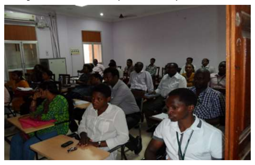
Hands-on Practice at the Departmental Computer Lab