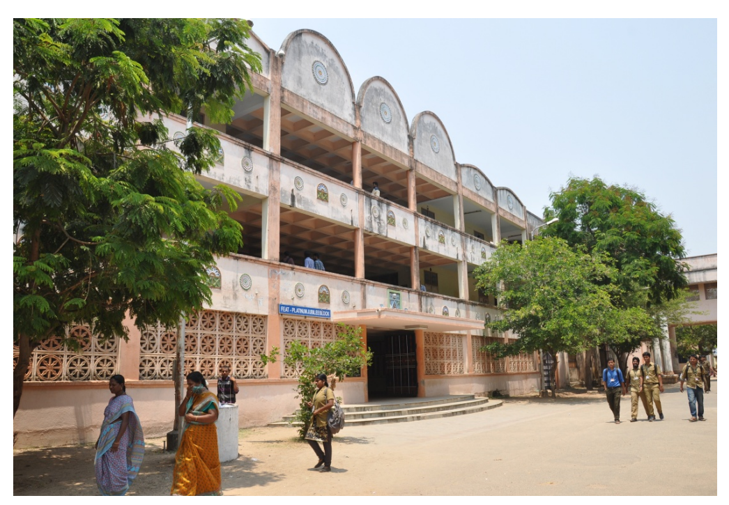
Class Rooms Platinum Jubilee Block