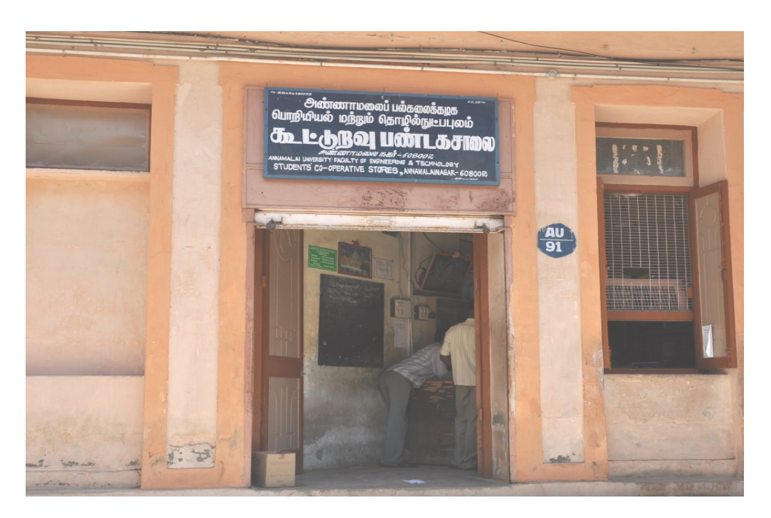
Students' Co-op Store