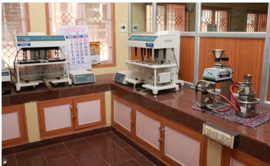
Jet Mill and Dissolution Test