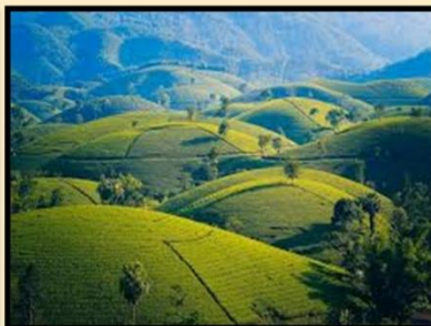
Kodaikanal (346 km)