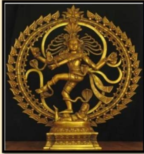
Thillai Nataraja Temple, Chidambaram (2 km)