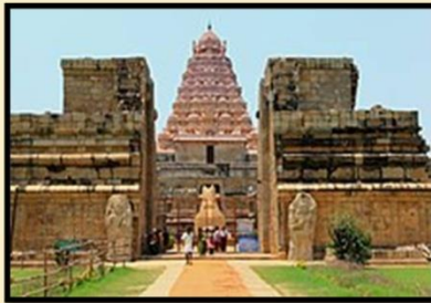
Gangaikonda Cholapuram Temple (43 km)