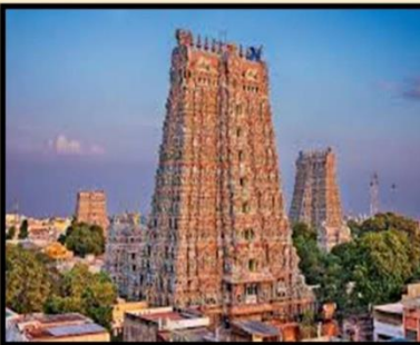
Ranganathaswamy temple, Trichy (145 km)