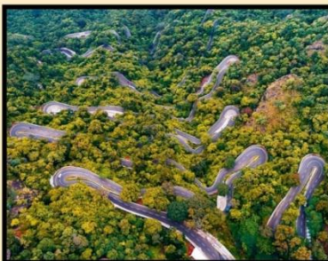
Yercaud (201 km)