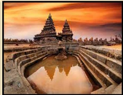
Shore Temple, Mahabalipuram (160 km)