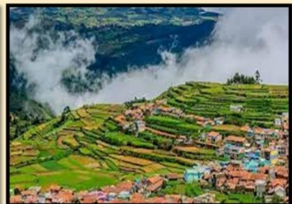
Ooty (391 km)