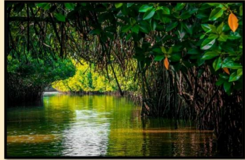
Pichavaram Mangrove forest (13 km)