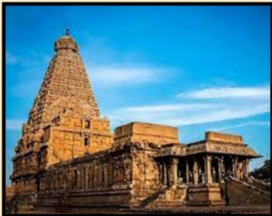
Brihadeeswarar Temple (124 km)