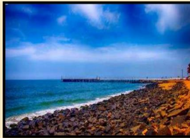
Promenade Beach, Pondicherry (65 km)