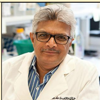
Suresh V. Ambudkar National Institute of Health, USA