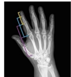
Fig. 4 Finger bones of human beings

The tapered shape of eggs, as in Fig. 3, permits them to fit more securely inside the nest and keep one another warm, besides it is the ideal shape for an egg to be pushed out of a hen. If it were perfectly spherical, they would be more likely to roll out of a nest and break. The finger bones of human beings perfectly obey mathematical angles and ratios that permit the hand to perfectly coordinate themselves in opening and closing in an elegant and effective way as shown in Fig. 4. These kinds of harmony can be seen in the shape and structure of each parts such as limbs, heart, lungs, ear, nose, eyes, and other organs of all living organisms and other parts of the entire universe. It is obvious that nature has been a creator, learner, teacher and spectator of the