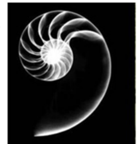
Fig. 2 Chambered nautilus

Nature on its own tailors the shape, structure, and the life style of all living organisms and adopts to the continuously changing situation and environment, which can be inferred as a continuous learning phenomenon. For example, the plants have learned how to organize their branches at precise mathematical angles that permit each leaf to absorb maximum amount of sunlight. Similarly, each floret in a cauliflower is a model of the branch and each branch is a model of the entire cauliflower as in Fig.1. Plants and Trees follow the same harmonious pattern-growing activities because it enables them to integrate the part with the whole and to function in an efficient and elegant way. The organism grows and changes in a chambered nautilus representing a form of difference, but the shell unfolds following the same mathematical ratio, denoting a form of sameness. These mathematical relations enable the shell to grow in an optimal and elegant way as observed in Fig. 2.