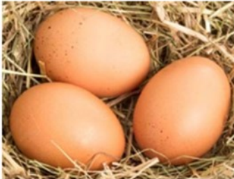
Fig. 3 Shape of eggs

The tapered shape of eggs, as in Fig. 3, permits them to fit more securely inside the nest and keep one another warm, besides it is the ideal shape for an egg to be pushed out of a hen. If it were perfectly spherical, they would be more likely to roll out of a nest and break. The finger bones of human beings perfectly obey mathematical angles and ratios that permit the hand to perfectly coordinate themselves in opening and closing in an elegant and effective way as shown in Fig. 4. These kinds of harmony can be seen in the shape and structure of each parts such as limbs, heart, lungs, ear, nose, eyes, and other organs of all living organisms and other parts of the entire universe. It is obvious that nature has been a creator, learner, teacher and spectator of the